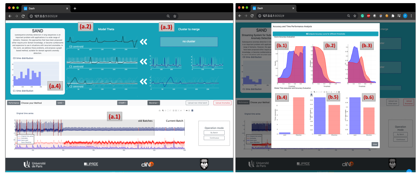
(a) Screenshot SAND system main frame